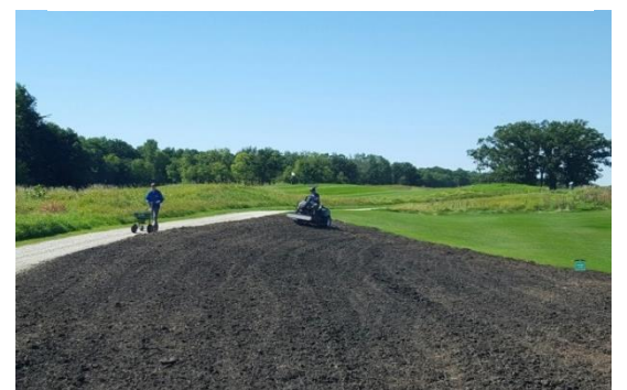
Seeding of the fescue renovation on the 17 th