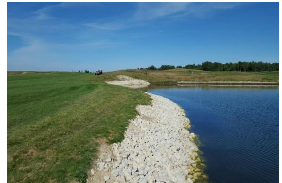
Rock rip rap installed on the 4 th hole.

Bunkers on the golf course have been much more playable this month with the new tines on the sand pros and reduced precipitation causing the sand to remain wet.